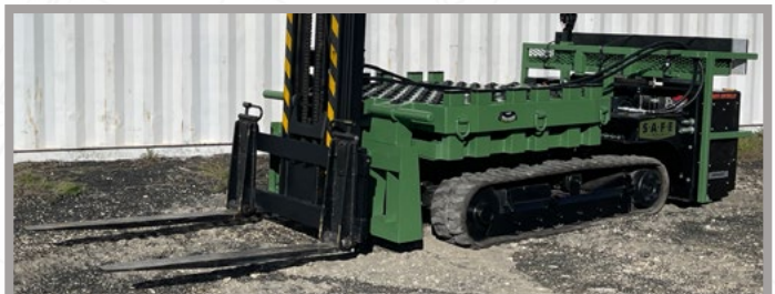
MULE with PA and Fork Riser Mast(FRM) Tested for 3,500+lbs to 6'