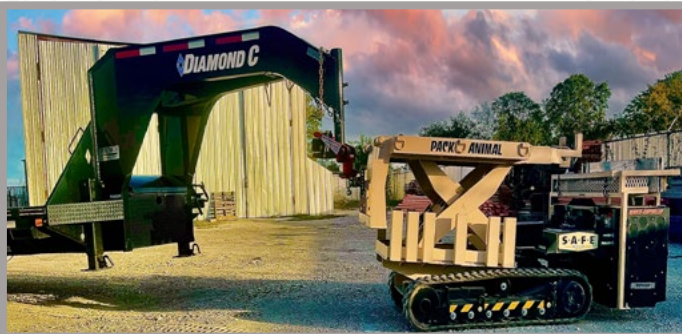
10,000+lbs Towing Capability