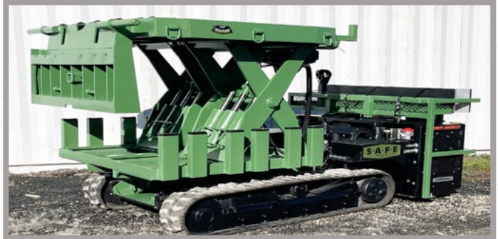
MULE with PACK ANIMAL(PA) 6,500-6,800lbs