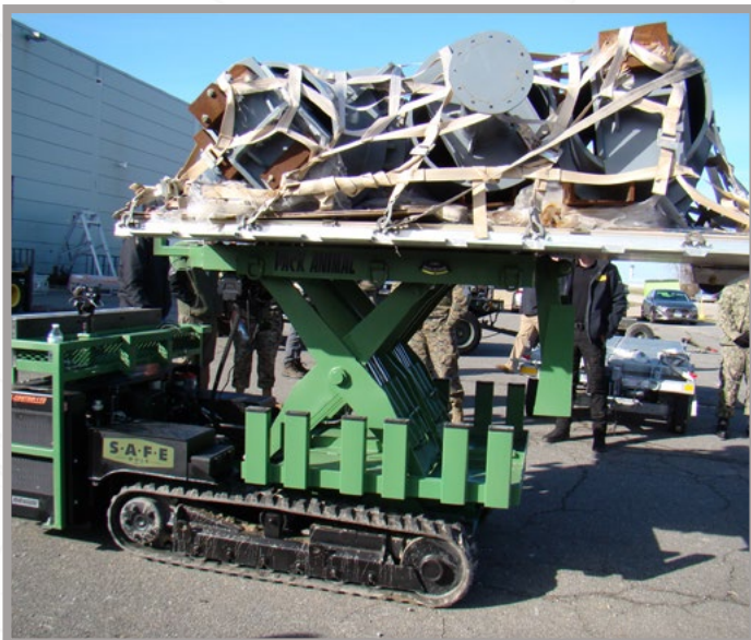
Scissor Deck Lifting Ability of 10,000+ lbs to 65"