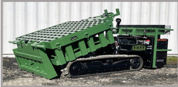
MULE with PACK ANIMAL(PA) 5' x 9'6" x 42" Tall