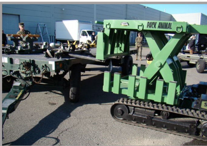
PACK ANIMAL Forks Capable of 4,500+lbs to 36" Height