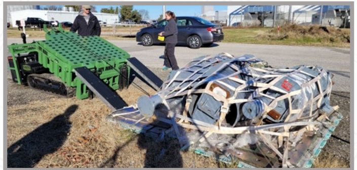
Ability to Load/Unload 463L Fully Loaded From/To Ground