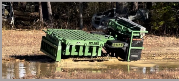
Remote Control Operated with No RF Hard-Wired Cable Option