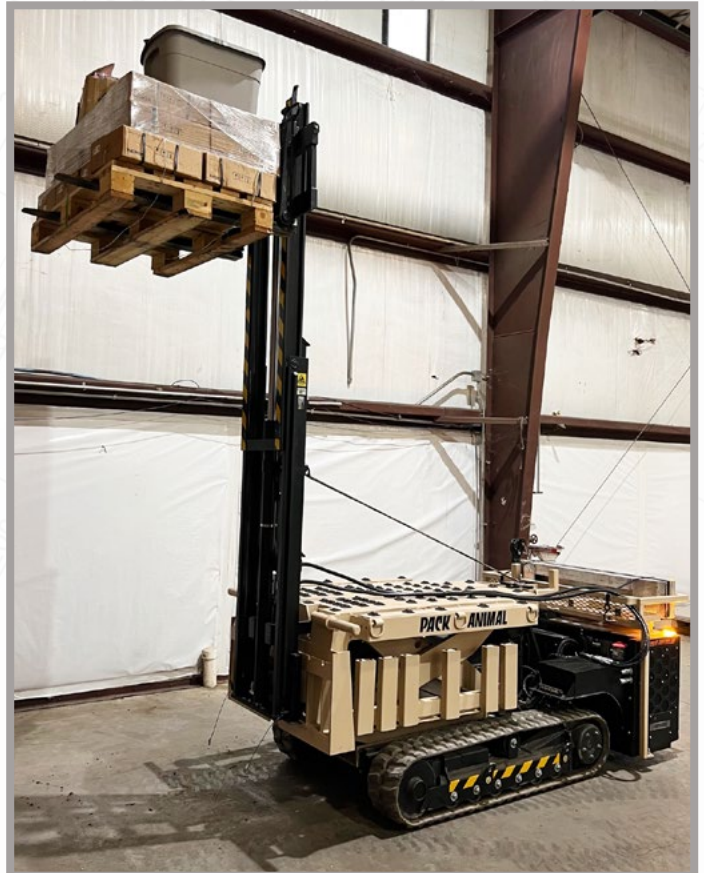
PACK ANIMAL with Fork Riser Mast Max Height of 11'