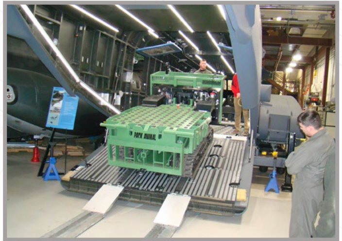
Capable of 18.5°+ Ramp and Terrain