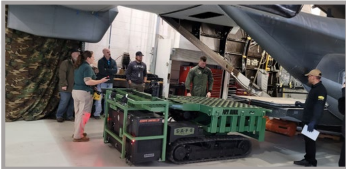
Built to Fit in an MV-22