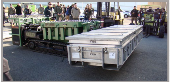
PACK ANIMAL Forks Capable of 4,500+lbs to 36" Height