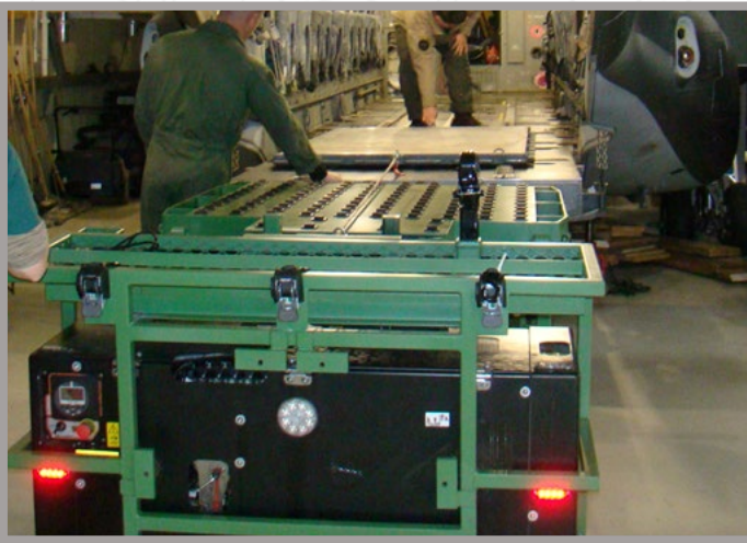
Loading/Unloading of Cargo Aircraft