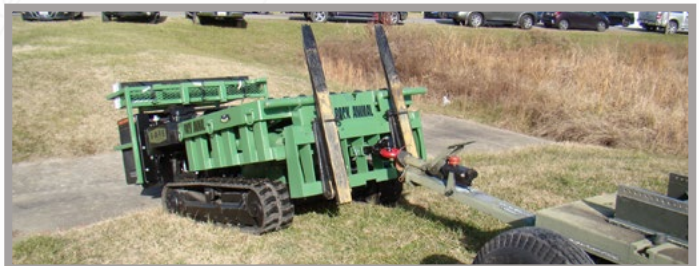
Hitch Receiver for Towing in Unimproved Terrain