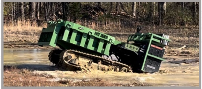
Operational in 24" Mud/Water/Snow